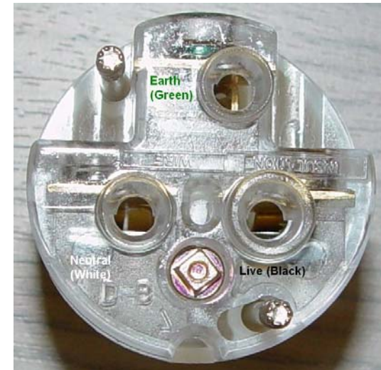
Cable Stripping Details.