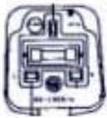
Plug Fuse: 13A

Description: UK13 H05VV-F3X1.00mm 2 2M “Y” JUNCTION BLACK 2X IEC320